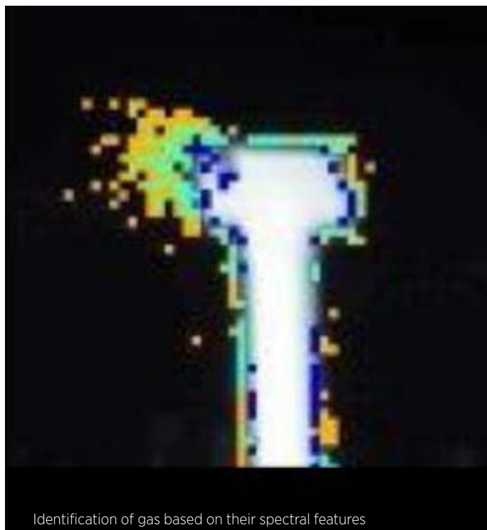
Identification of gas based on their spectral features