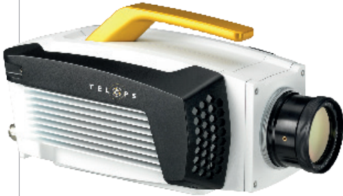
The IP-67 certified enclosure