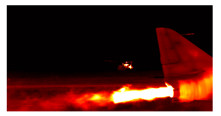
Jet engine IR signature measurement