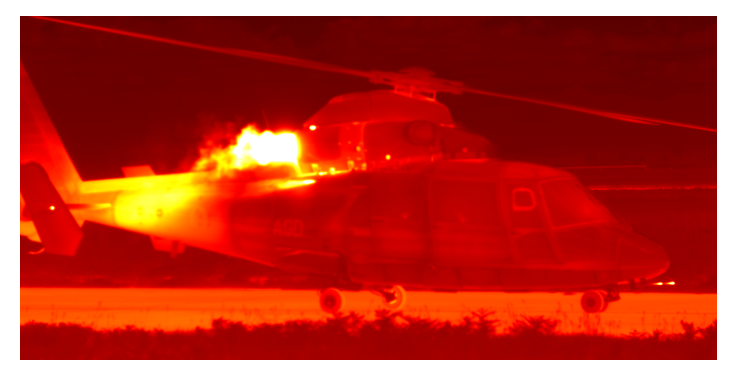
Helicopter IR signature characterization