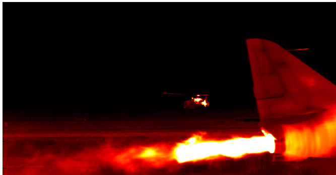
Jet engine IR signature measurement