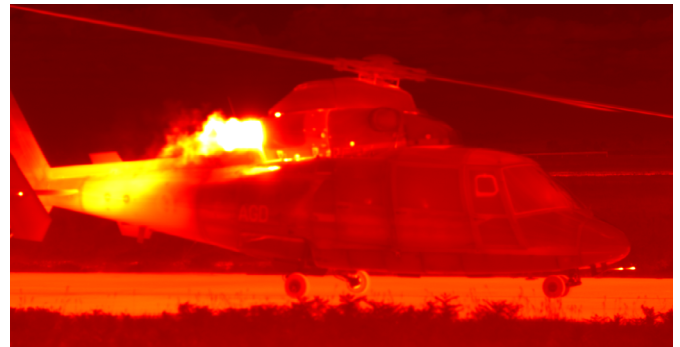
Helicopter IR signature characterization