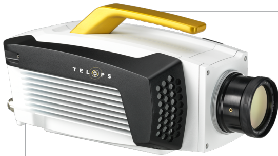
The IP-67 certified enclosure.