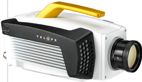
The IP-67 certified enclosure