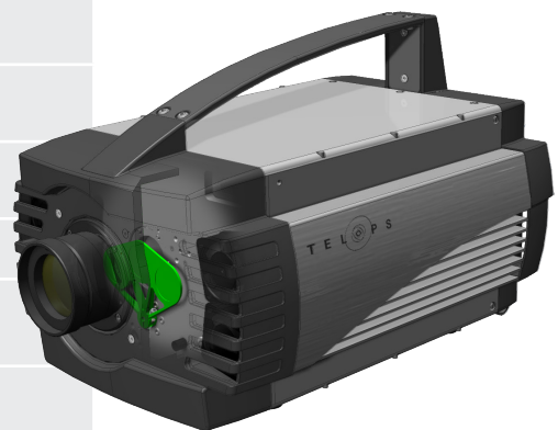
The automated 3-position filter mechanism.