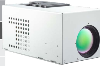
The R100 MC enclosure.