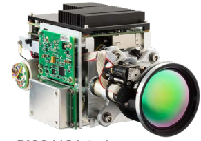
The R100 MC interior.